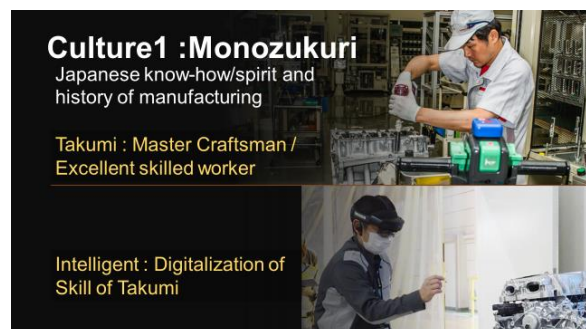
“Culture of Japanese Company for Business in India”