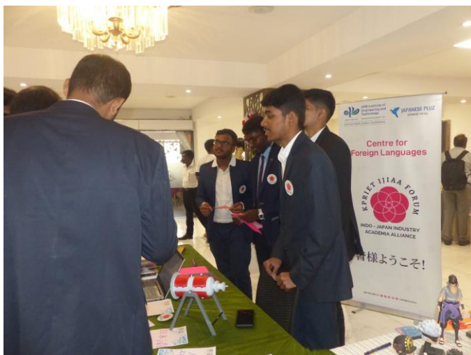
Introduction of Japanese technology by KPR Institute of Engineering & Technology