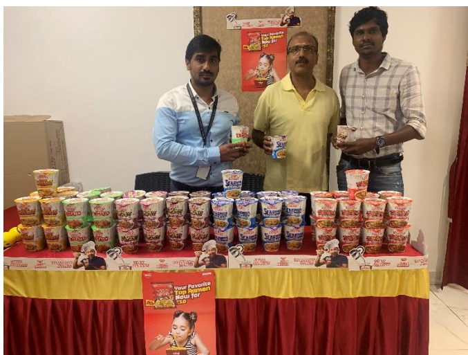
Cup Ramen Noodles by Nissin India