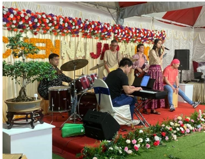
Performance by Chennai Karaoke Band