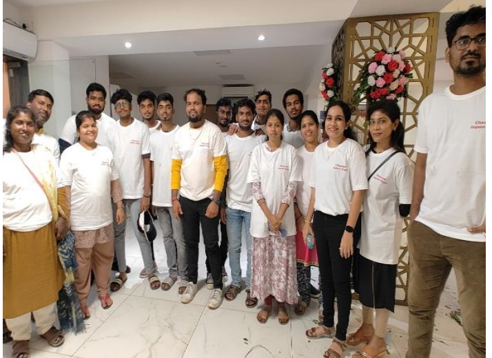
Volunteers for assistance