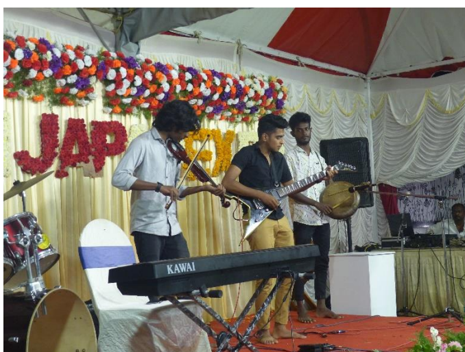
Music Performance by Loyola College Students