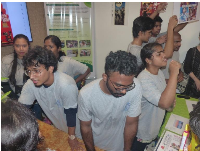
ABK-AOTS Dosokai, Tamilnadu Centre conducting workshop on Japanese Festival