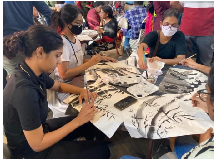
Participants in Sumi-e workshop