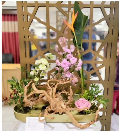
Ikebana by Chennai Sogetsu Branch