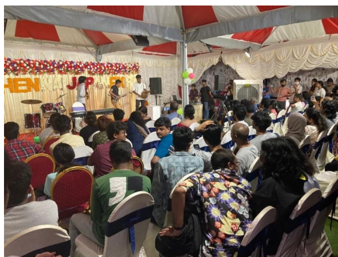
Participants enjoying the live music performance