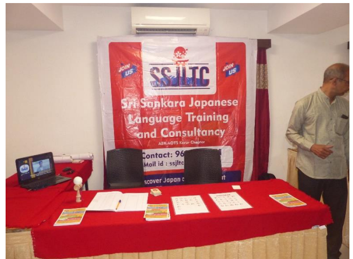
Play workshop by Sri Sankara Japanese Language Training and Consultancy