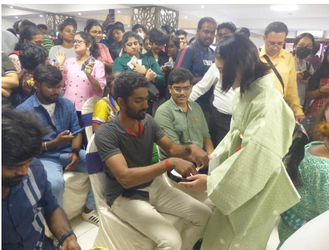
Participants enjoying Tea in the Tea Ceremony