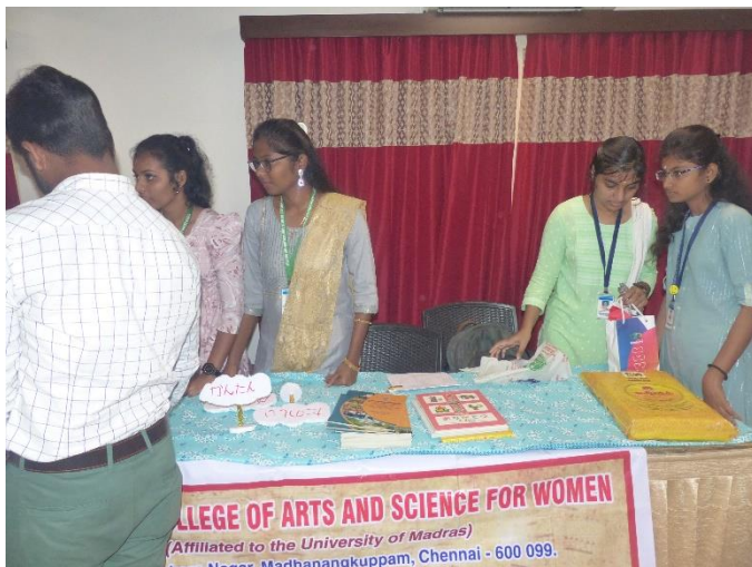
Japanese workshop by Soke Ikeda College of Arts & Science for Women