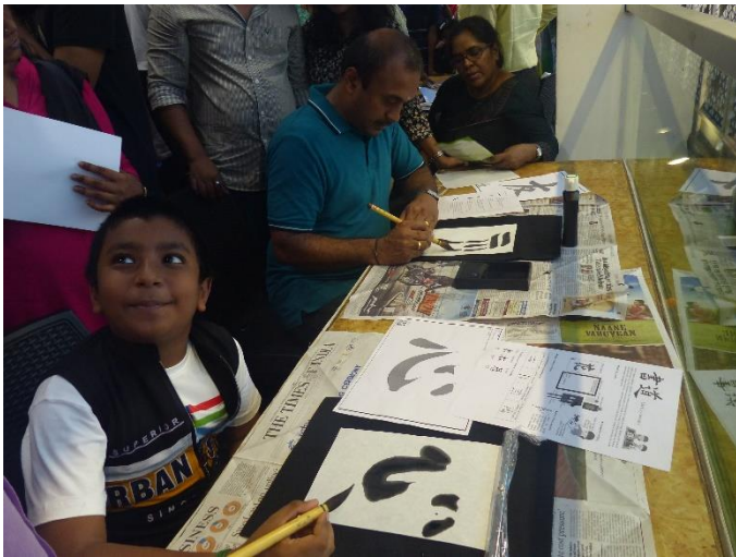
Participants experiencing calligraphy for first time