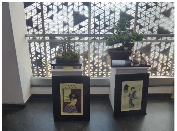
Bonsai exhibition by Bodhi the Chennai Bonsai Association