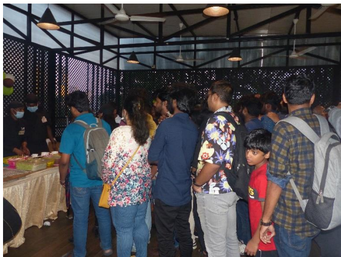
Participating queuing for tasting the Japanese Food