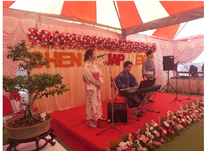
Welcome address and opening song (Haru no Umi)