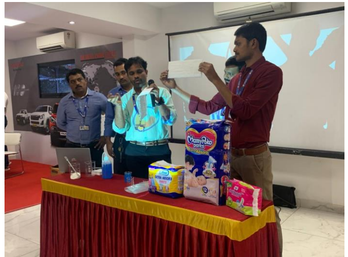
Demonstration of Water absorption by UNICHARM