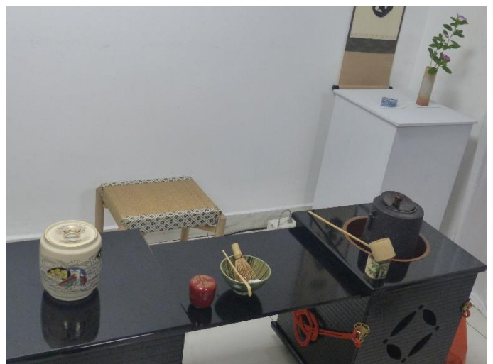
Tea Ceremony table