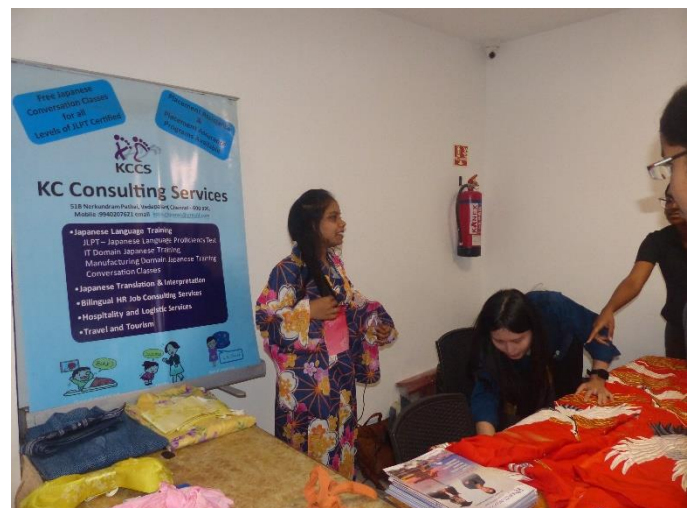
Kimono display by KC Consulting Services