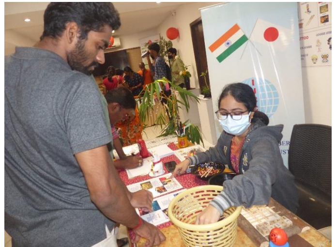
Indo-Japan Chamber of Commerce and Industry (IJCCI) conducting Play workshop