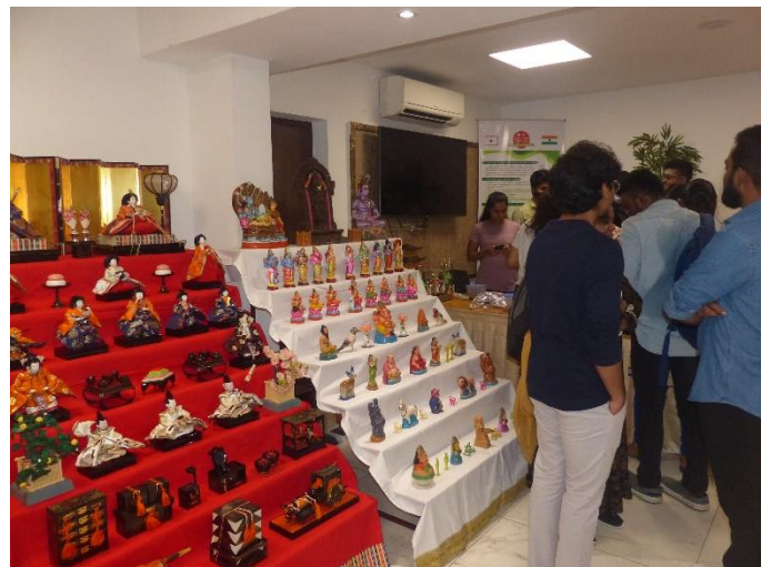
Display of Hina dolls and Indian Golu dolls