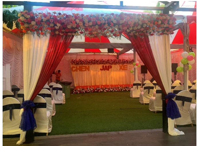
Stage setting in the Roof Top covered with Arabian Tent to protect from sun and rain