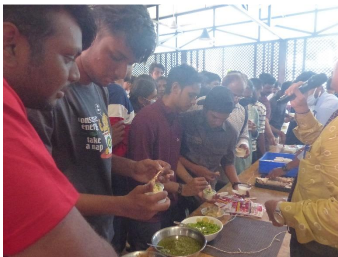
TOFU lecture and demonstration