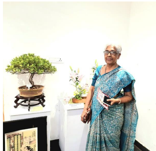
Ikebana by Ohara School of Ikebana