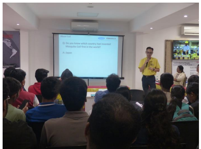
Fumakilla's presentation on the history of Japanese mosquito repellent