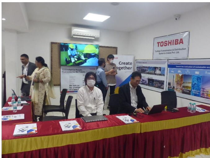
Corporate Culture explanation by TOSHIBA, Hyderabad