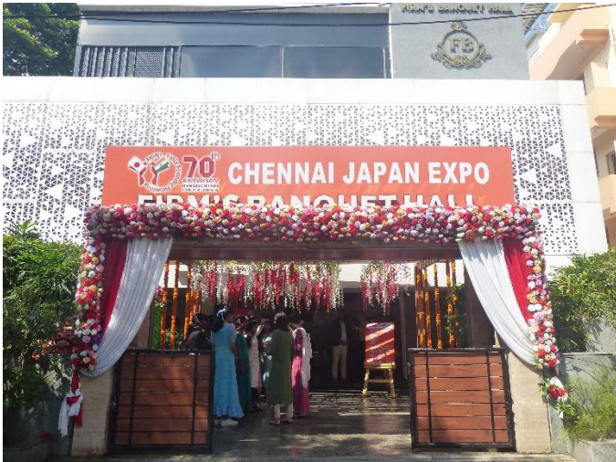
Event venue entrance