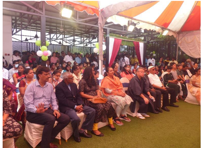
Participants in the inaugural ceremony