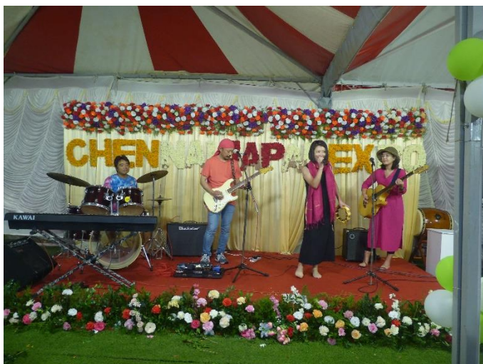
Japanese song performance by Pink Kuroimmo