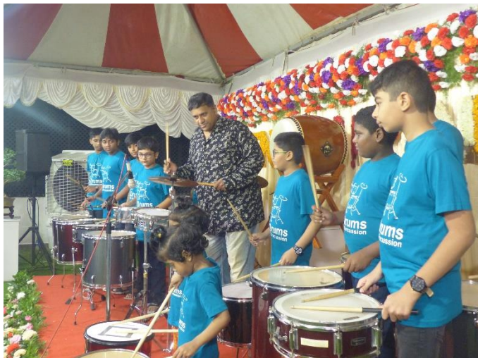
Wadaiko drum performance by JUS Drums School