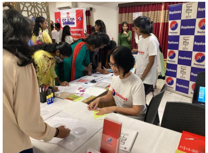
Hayakawa Japanese Language School & Cultural Centre - take a Japanese lesson