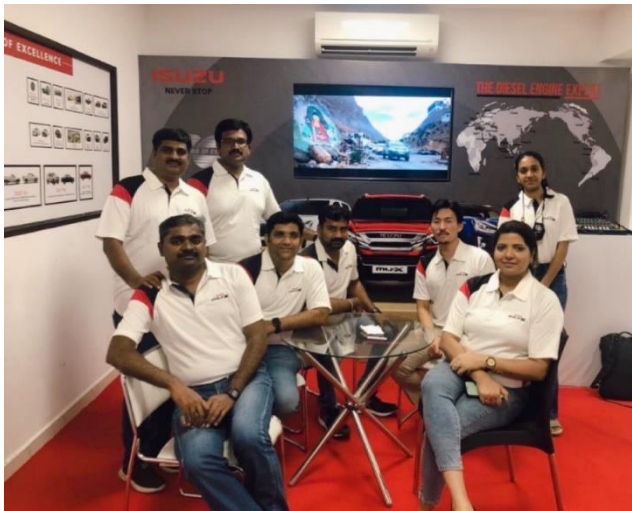
ISUZU presentation on manufacturing culture